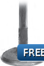
Intake Valve after P.i. Treatment