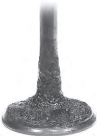
Intake Valve before P.i. Treatment