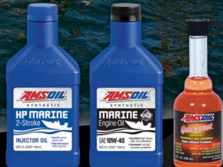
SYNTHETIC 2-STROKE OIL