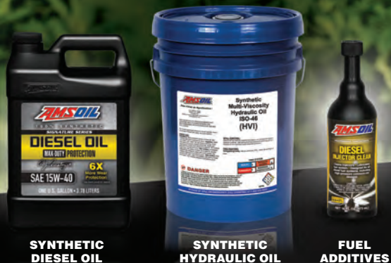
SYNTHETIC DIESEL OIL