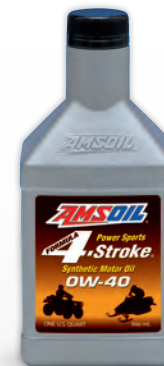
AMSOIL 0W-40 Formula 4-Stroke® Power Sports Synthetic Motor Oil