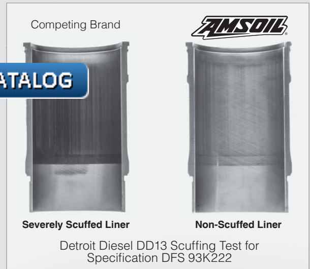
Detroit Diesel DD13 Scuffing Test for Specification DFS 93K222

Signature Series Max-Duty has a low rate of volatility (burn-off), reducing oil consumption during operation and passing less oil vapor into the combustion chamber. It provides up to 76 percent less oil consumption than required by the API CK-4 standard in the Caterpillar-1N oil consumption test.