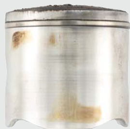
SABER Professional @ 100:1