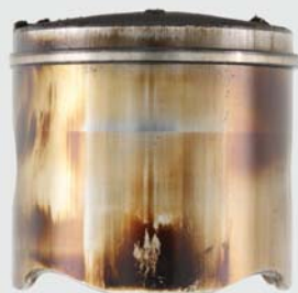
ECHO Power Blend @ 50:1