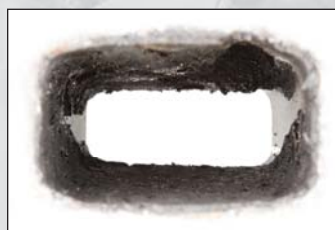
SABER Professional @ 100:1 4% Airflow Loss